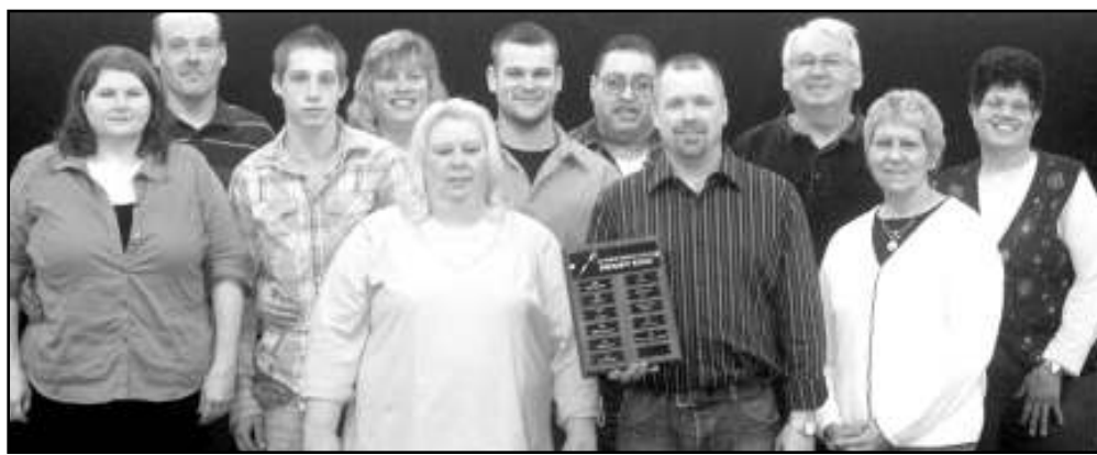
Tournament Winner: Christian Church of Demotte The Christian Church of DeMotte dartball members walked away winners in the multi-county dartball tournament held this year.

Dartball is a game in which darts are thrown at a large homasote board that resembles a baseball field with colored areas that denote bases. Dartball uses baseball-like rules and scoring. Dartball is simply baseball played with darts on an elaborate board four foot square. The rules are basically baseball rules. There are generally nine players on a team, but teams can consist of any number you wish. Players stand approximately 20 feet from the