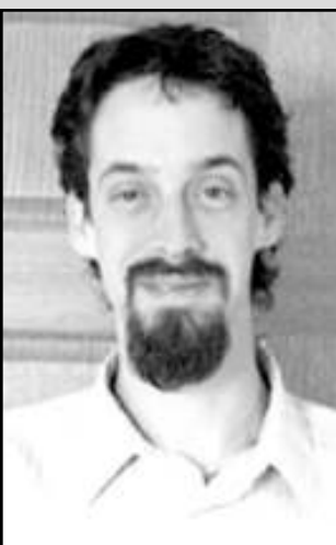
Up to this point I

BY DAN PERKINS GUEST COLUMNIST DANIEL.PERKINS@ IN.NACDNET.NET