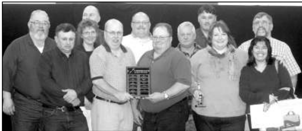
Sorrowful Mother dartball members placed first in the local KV Dartball League comprised of 10 teams throughout the area. The record for the members of Sorrowful Mother was 38 wins and 16 losses.

board (but players can move in closer if their ability requires) and throw darts underhand or overhand at the board to score hits, strikes, balls, fouls, and outs