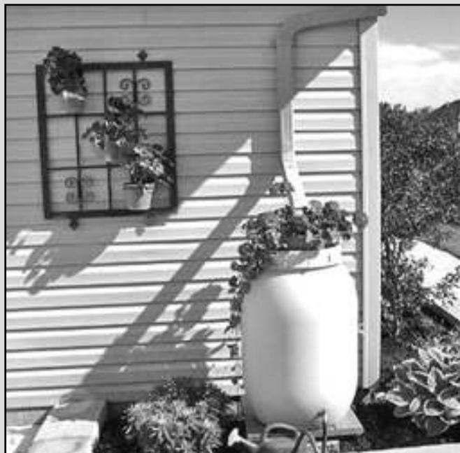
To order a rain barrel contact the Jasper SWCD Office: 219-866-8008 ext 3. Four colors available.

Rainwater collection and reuse is beneficial to soil and water because the stored water would otherwise run off into the storm sewers, bringing pollutants such as sediment, oil and grease, bacteria, and nutrients