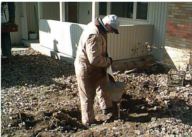
Abandoned water well being plugged by a licensed water well driller.

A water well that has not been used for more than three months, but is not abandoned, must be sealed at or above the land surface with a welded, threaded, or mechanically attached watertight cap.