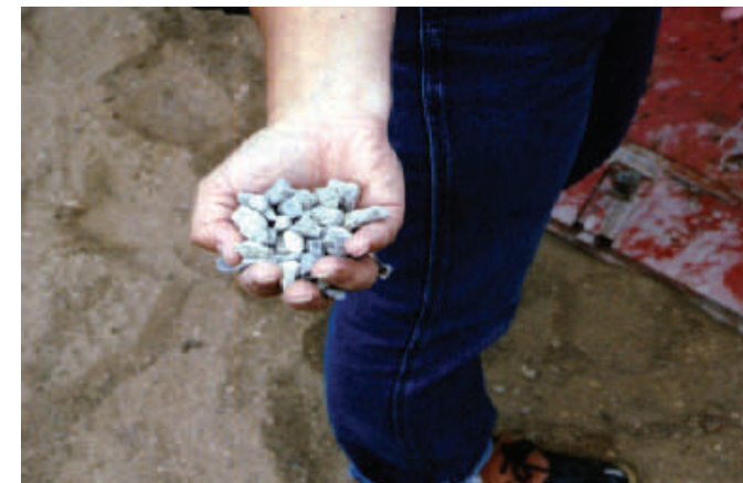
Bentonite material used for well plugging.

Wells must be sealed at or above the ground surface with a welded, threaded, or mechanically attached watertight cap. The Division of Water recommends that the well also be completely filled with impervious grouting material as specified in 312 IAC 13. A well that poses a hazard to human health must be plugged with impervious grouting material.